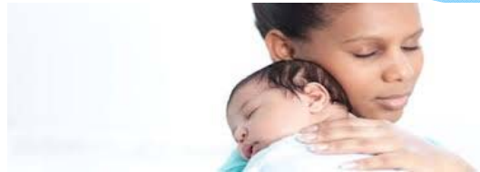
Mother's maiden name