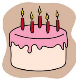
Date of birth Place of birth