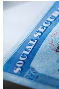
Social Security Number