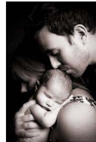
Names of parent or other family members